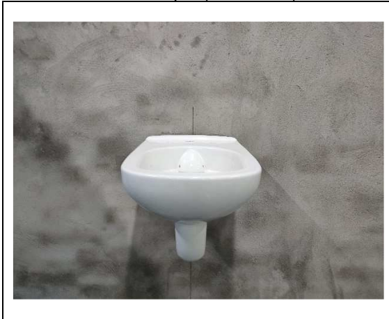
Test sample (Front view)